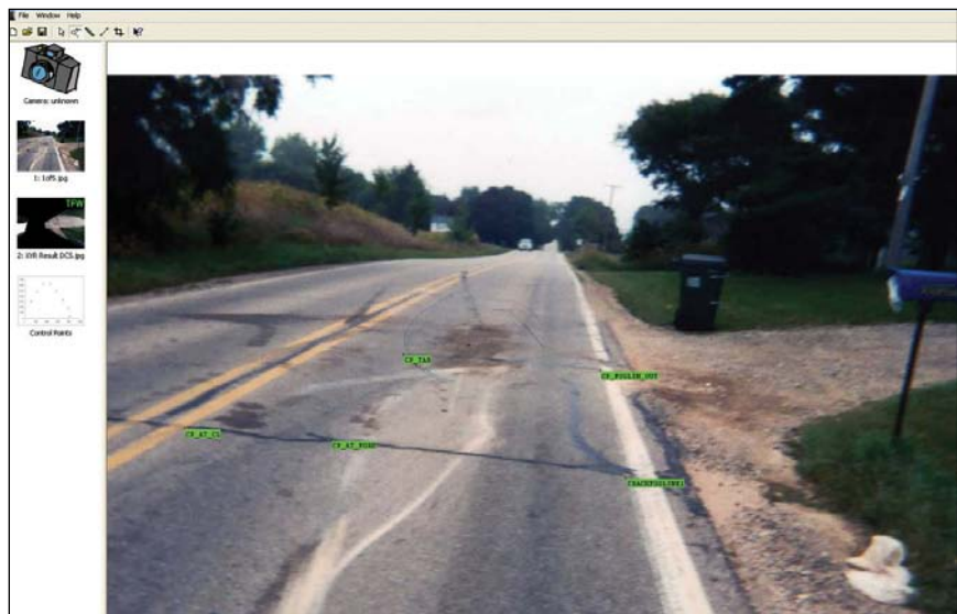
Figure 2 —The same control points in Figure 2 were marked in the original police photo using XYRectify software.