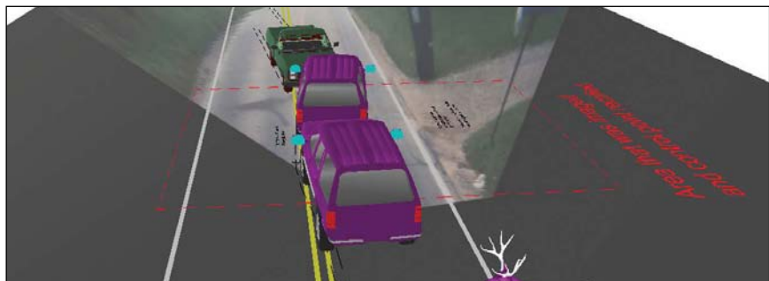
Figure 3 —This oblique view with a CAD overlay shows how the scene may have looked just prior to and at the moment of impact. Vehicle 1 is shown here in purple; Vehicle 2 is green. The deer location is not exact and included for illustrative purposes only.